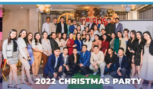
2022 CHRISTMAS PARTY