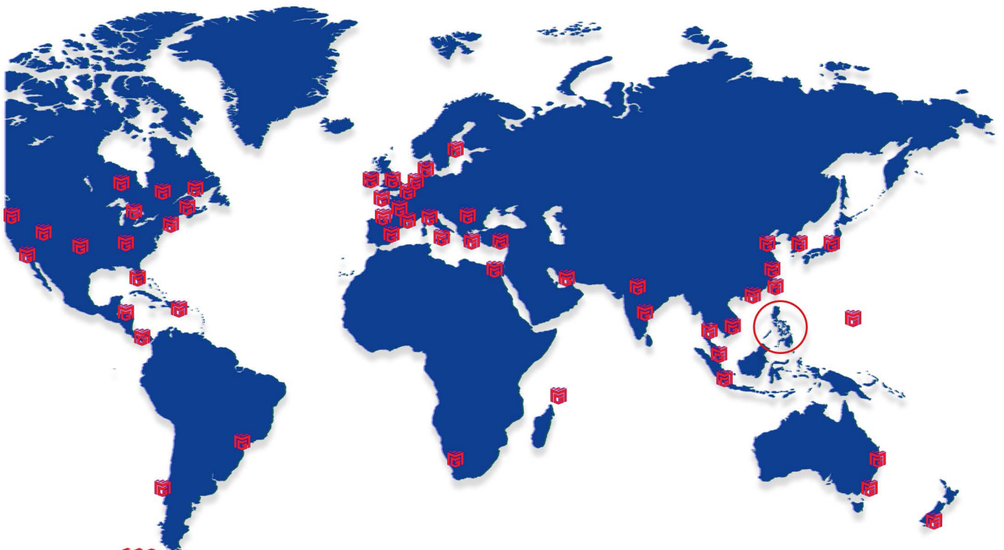
Head office / Parent company locations of MNEs we have served.