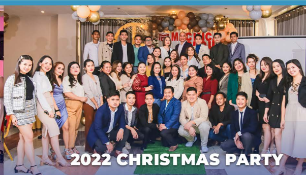
2022 CHRISTMAS PARTY