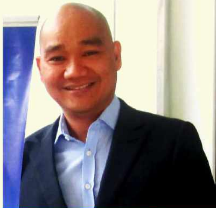
Chairman and Managing Partner