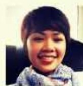
Middle East (English & Arabic language)