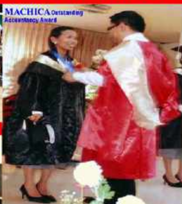
MACHICA Outstanding Accountancy Award