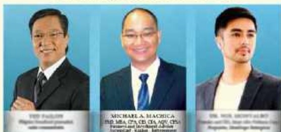
Superbrands Marketing International, Inc.