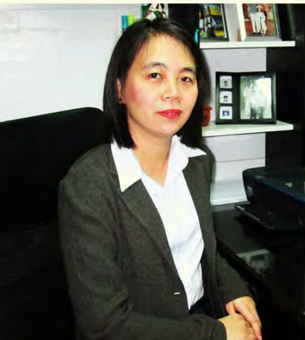
President, Machica FIRM, Inc. Finance / HR Head, Machica Tan-Cruz & Co.