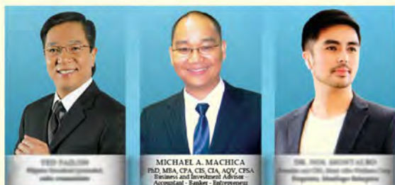
Superbrands Marketing International, Inc.