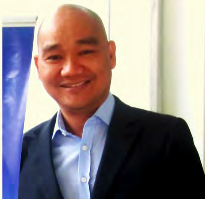
Chairman and Managing Partner