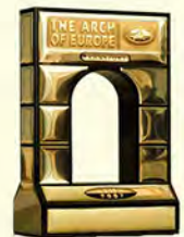
ARCH OF EUROPE GOLD AWARD QUALITY & TECHNOLOGY B.I.D. AWARDS FRANFURT, 2014