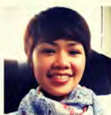
Middle East (English & Arabic language)