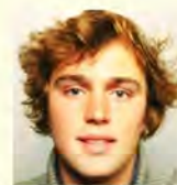
France-Belgium (French & English language)

Apt. 92 Academy Bldg., Park West, Dublin 12, Republic of Ireland +35 31657 213 mail@machicagroup.com