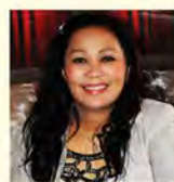
UK & Ireland (English language)

Flat No. 901 Professional Bldg., Najda St., Abu Dhabi, United Arab Emirates +971 52832 1199 mail@machicagroup.com